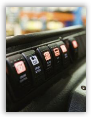
Large illuminated rocker switches for easy operation