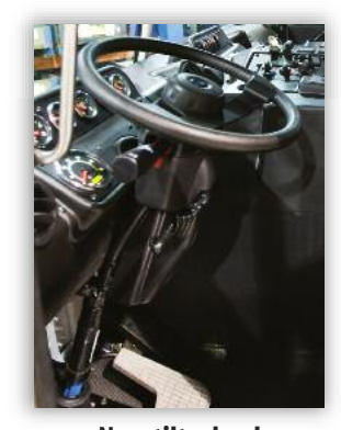
New tilt wheel for comfort and control