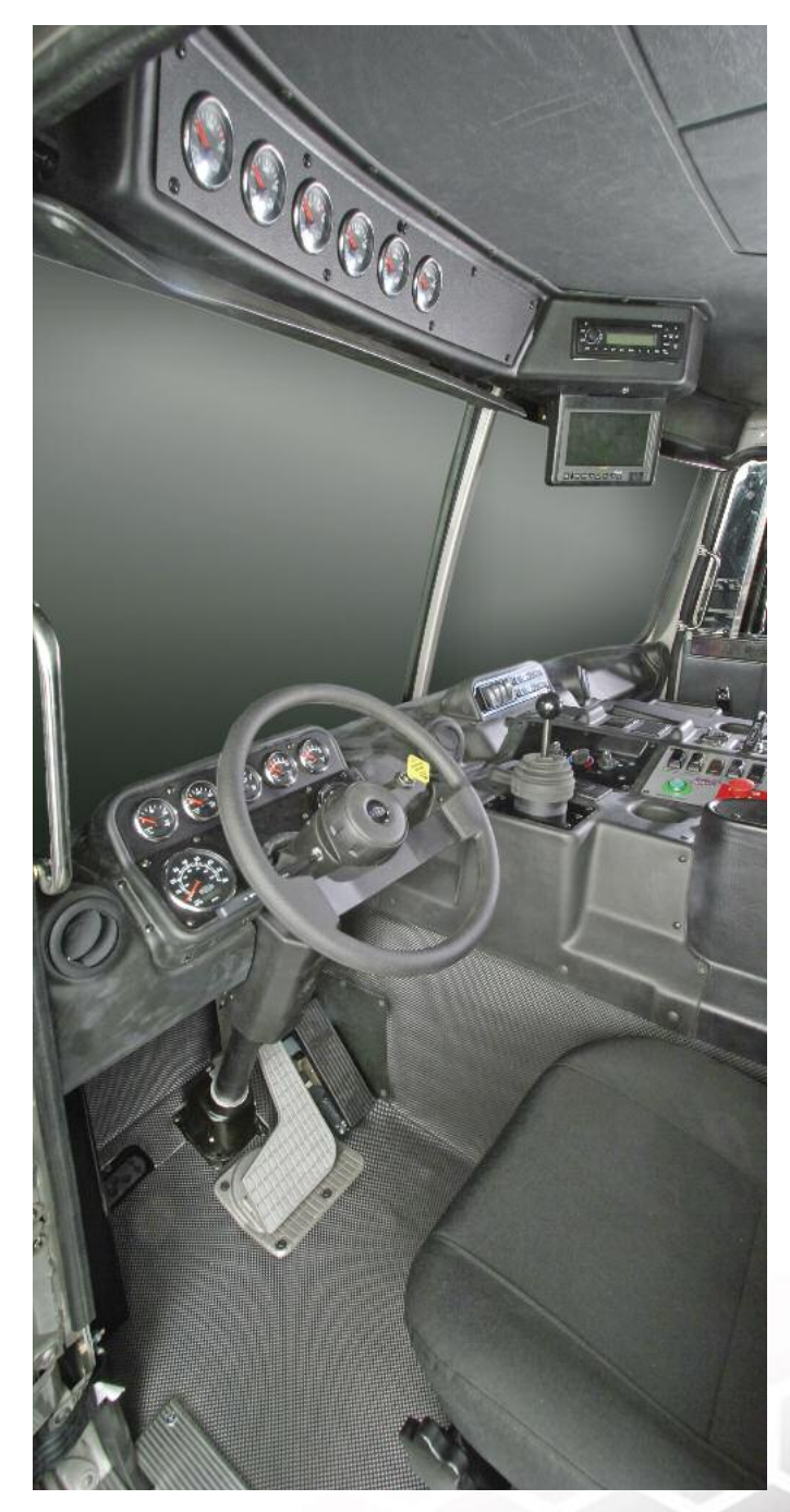
The Autocar Xpeditor has roomier cabs with more options and greater convenience than any other low-cab truck.