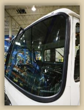
Curved windshield with narrow A-Pillars improve peripheral vision