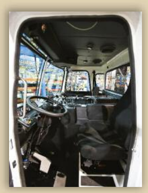
Expanded operator room – increases comfort and productivity