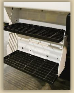
Lowered cab for easier access and safety

There's nothing tougher than the demands placed on vocational trucks – frequent starts and stops, short runs, big loads, rough terrain, tight areas, heavy power demands, tough traffic and weather, not to mention meeting the demands for operator comfort and productivity. With the strongest cab in the industry and the best overall strength-to-weight ratio, the Autocar Xpeditor ACX continues to be the hardestworking LCF truck you can buy. And, they offer the lowest overall cost of ownership in the LCF market.