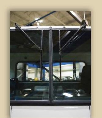
Roof-mounted vertical-park wipers and flush mounted, LED marker lights