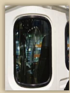
Corner windows in B-Pillars improve visibility and safety