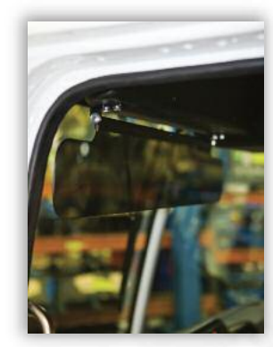
Fold-away opaque sun visor enhances visibility and safety