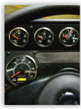
Clear, easy-to-read gauges improve safety and convenience

All of the Xpeditor's competitors use fiberglass and composites in their cabs and/or doors. Autocar's ACX is the only cab – doors included – that's manufactured entirely of fully welded, two-sided galvanized steel. Add in an electronic, fully-blended HVAC system with 28% better efficiency, a multiplexed electrical system with integrated diagnostic capabilities and you'll understand why the Xpeditor claims the title of "hardest-working cab in the business."