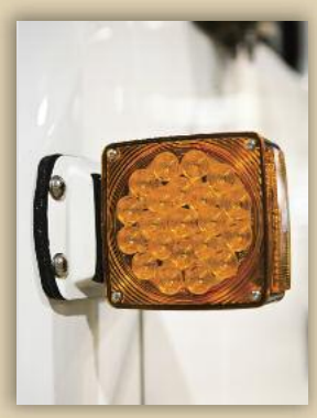
High visibility LED marker lights increase road safety